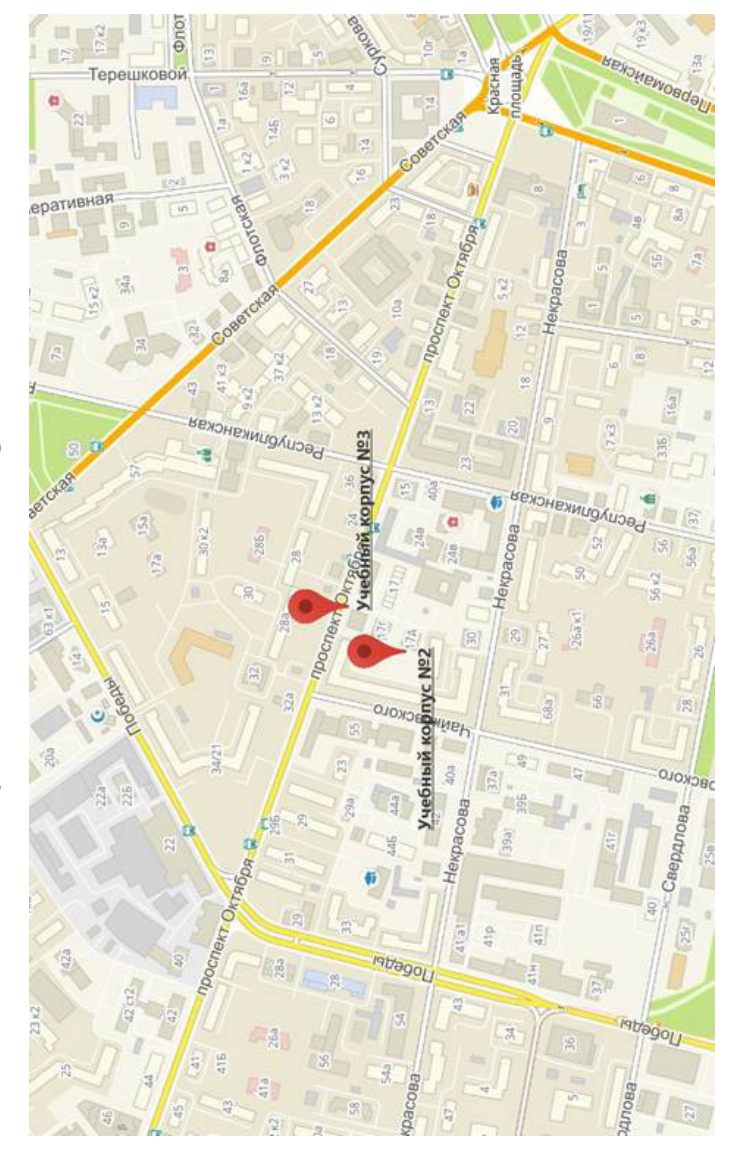
The layout of educational buildings No. 2 and 3