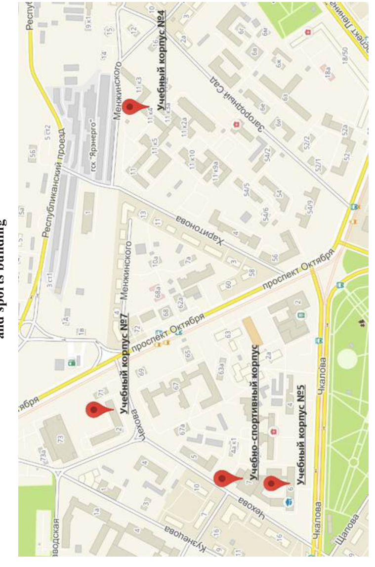
The layout of educational buildings No. 4, 5, 7 and the educational and sports building